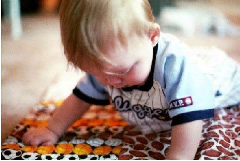
"The ref says I have to keep my eye on the ball."

We have enough youth. How about a Fountain of Smart?