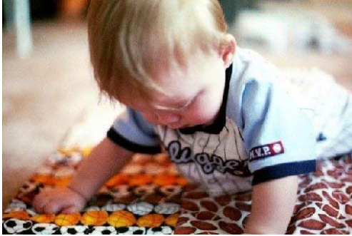
"The ref says I have to keep my eye on the ball."