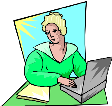
From the Founder's Desk

Handmade Hugs is a totally volunteer organization dedicated to comforting kids with security blankets. This is a local chapter of PROJECT LINUS